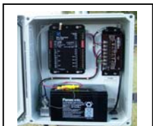
Nema 4X Pkg